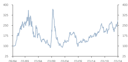
■ Class A (USD) Dis.