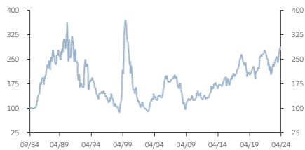
■ Class A (USD) Dis.