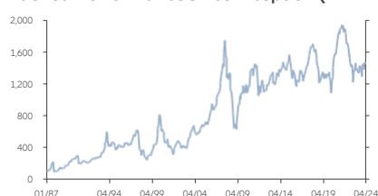
■ Class A (USD) Dis.